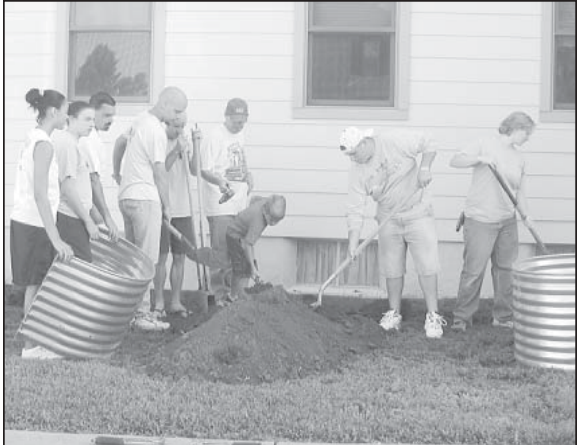
OUT OF TOWN GROUPS help work on the new addition at The First Baptist Church.

Interment was at St. Francis Cemetery, St. Francis.