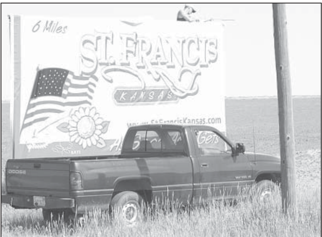
THE NEW SIGNS ARE UP! Signs welcoming visitors to St. Francis have been put up both east and west of town. The Chamber has been raising money for the signs but, if it were not for the generous donations, there would still not be any signs.