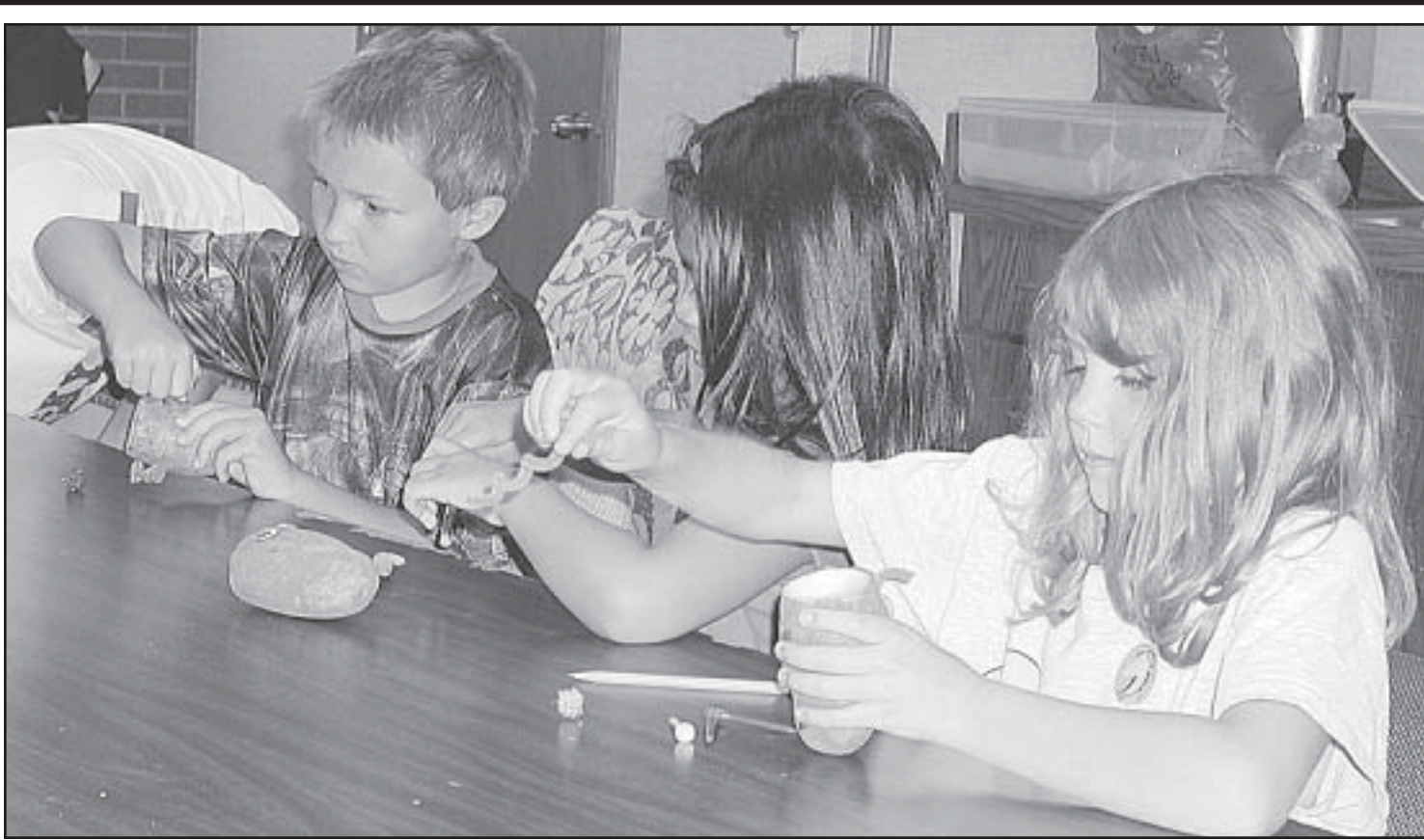
SUMMER READING PROGRAM is in full swing at the St. Francis Public Library. The program offers a lot for the kids to do besides just reading.