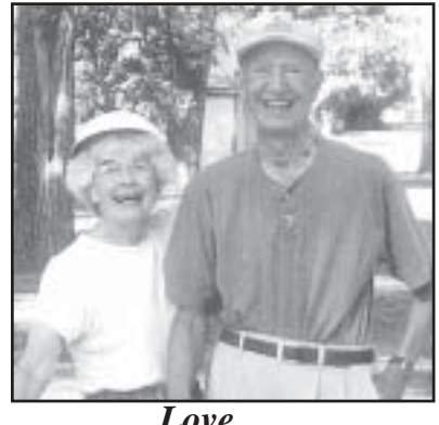
Love, Your Cram Crew