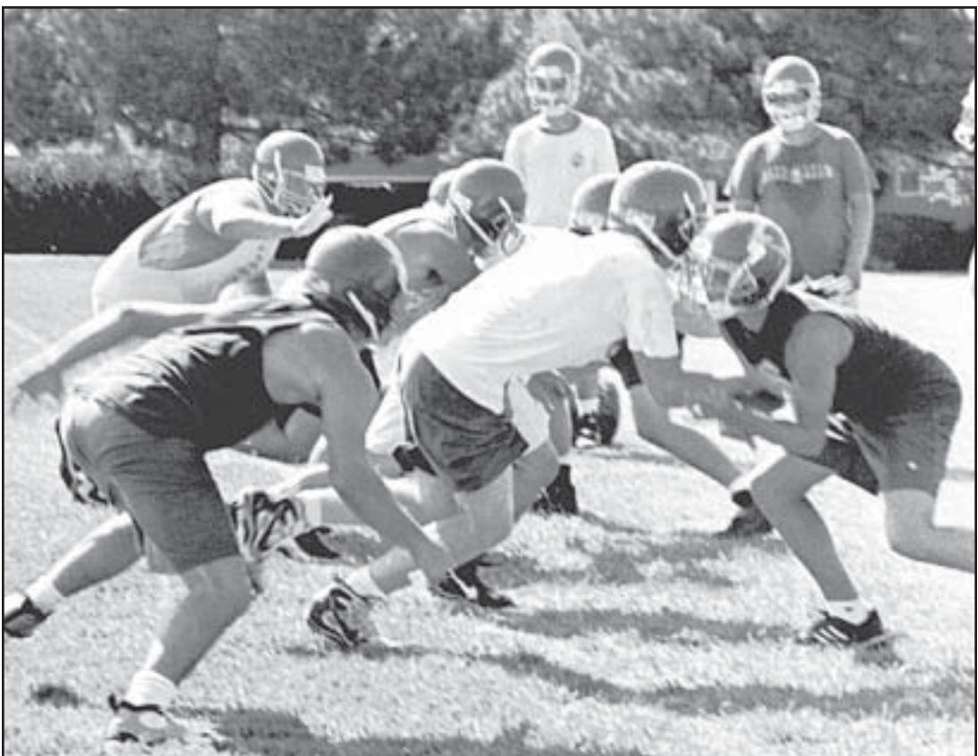
HOT TEMPERATURES greeted football players who are having two-a-day practices this week in preparation for the new season.