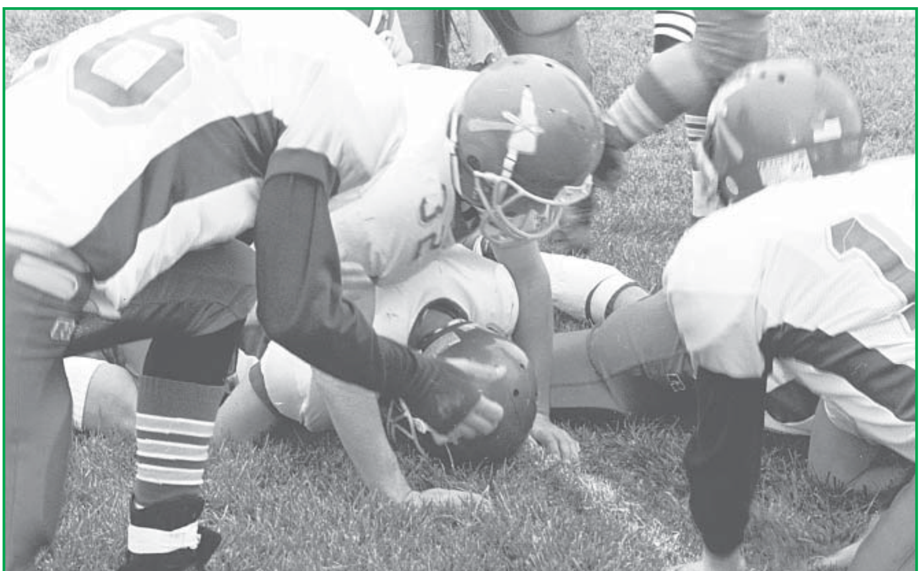
GRAB THAT BALL!!! Sainty Indians fumbled the ball but were able to recover it before Trojans could pick it up. The Indians won the Regional Championship on Saturday when they played against Stanton County at Johnson. They will meet Claflin on Saturday.

St. Francis fans are expected to fill the stands at Greene Field on Saturday to cheer on the Indians.