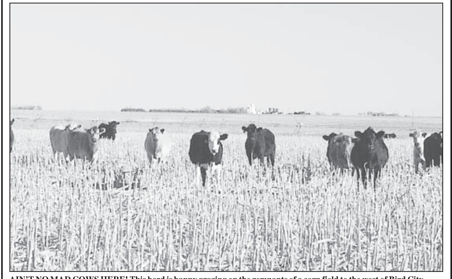
AIN'T NO MAD COWS HERE! This herd is happy grazing on the remnants of a corn field to the west of Bird City.