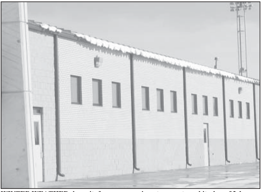
WINTER WEATHER shows its furry once again as temperatures hit a low of 3 degrees on Monday. Above - Even with winter back very little snow fell as can be seen on the high school gym; below - work still continued around town as the city crew began the task of removing the Christmas lights from Main Street.