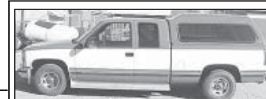
'96 Chevy Pickup - Red and white, C-1500, ext. cab, cruise control, CD/cassette, bench seats, hitch, camper shell, 89,136 miles, #P6085A ... $11,500

'01 Chevy Lumina - Green, 3.1, V6, cassette, power windows, power door locks, 60,601 miles, #P5204 ... $7,200