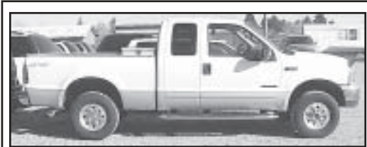
'01 Ford F250 XLT - 4x4, white-gray, power stroke, cruise control, V6, CD, tow-pkg. caps, bars, 49,035 miles, #P6186A ... $27,600