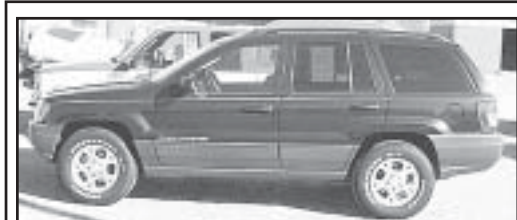
'02 Grand Cherokee Jeep - Blue, Laredo Sport, 6-cyl., cruise control, CD/cassette, leather seats, 53,485 miles, #P6144A ... $19,500