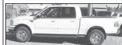
'02 Ford F150 Lariat - 4x4, white, super crew cab, 5.4, cruise control, CD/cassette leather/heated seat, 17,821 miles, #346176A ... $27,000