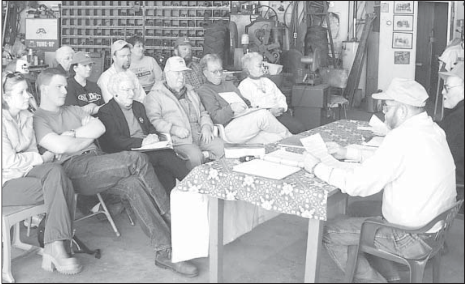
MEMBERS OF THE TRI-STATE Antique Engine and Thresher Show Association met at the shop to make plans for this summer's 51st annual show which will be held this summer.

The next Lions meeting will be 6:30 p.m. Monday, March 22 at the Windmill Restaurant. Men and women of all ages interested in becoming a Lion are encouraged to attend.