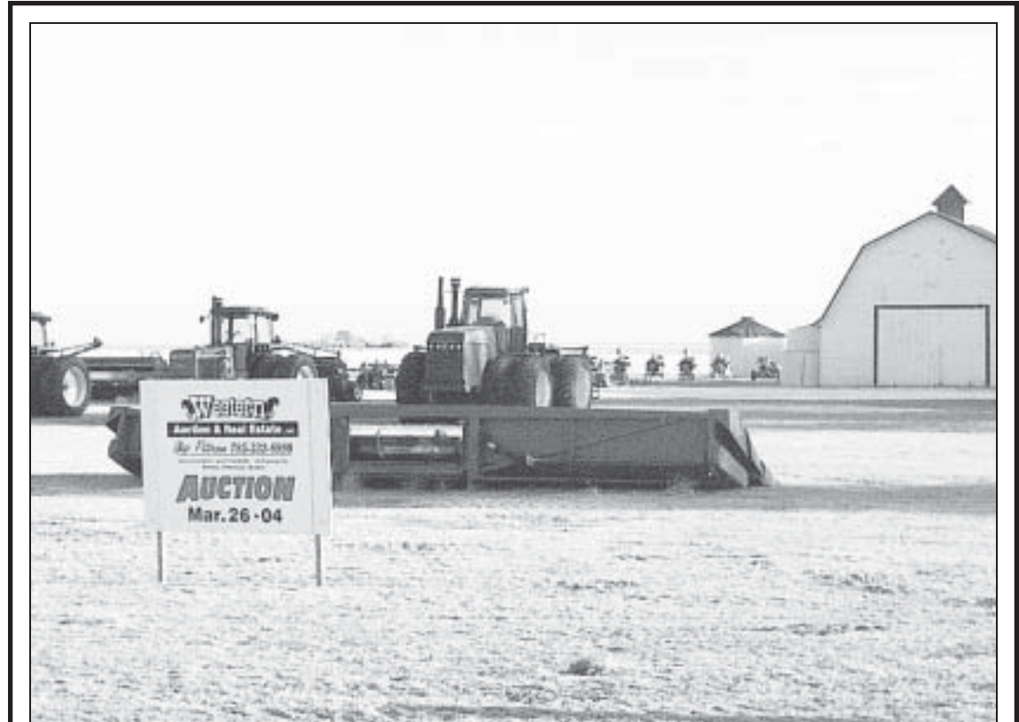
CARMICHAEL'S FARMS are down sizing. The Bird City family will have an auction this Saturday to sell some of their equipment.