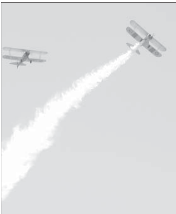
STEARMAN BI-PLANES perform a formation during the Stearman Fly-In held on Sunday in St. Francis.

The skydivers thrilled the crowd with advanced canopy maneuvers, See FLY-IN on Page 10A