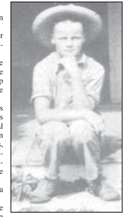
WHO IS HE? Guess who the Cheyenne County Fair Parade Marshal is, all grown up now.

This year, the committee decided that it would be best if people had their entry description and forms to the committee by 5 p.m. on Friday, ing. They will take entries the morn- or 785-332-3212, respectively.