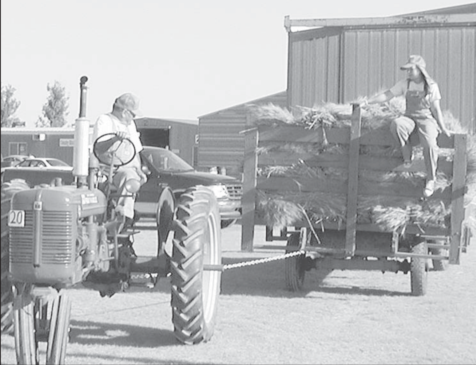
WHEAT IS PULLED FROM one of the buildings at the Thresher Show Grounds to be taken to the display area and separated. Large crowds viewed a variety of events at the 51st show.