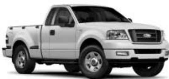
F-150 Regular Cab