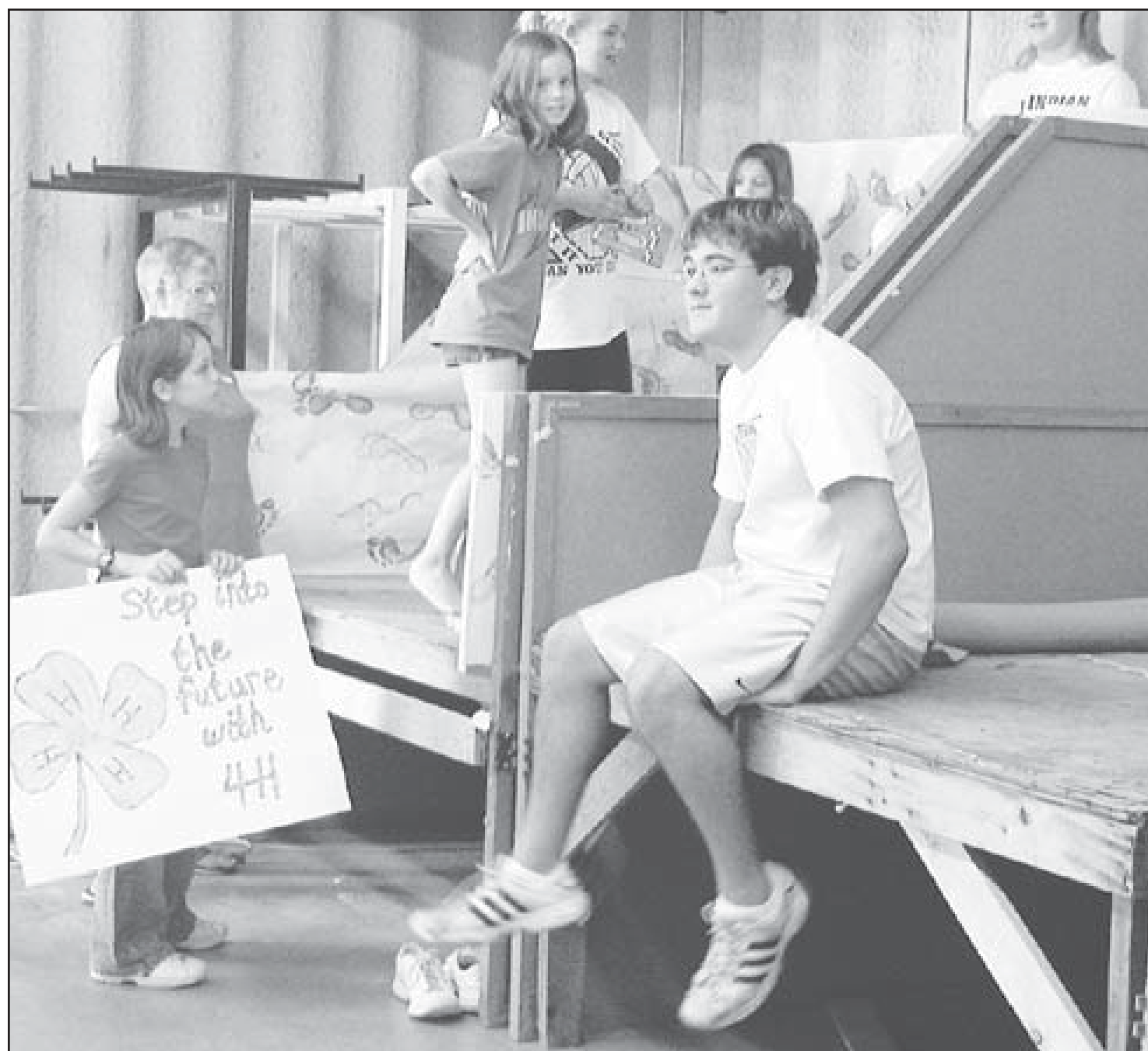
MEMBERS OF the Lawn Ridge 4-H Club get their booth ready for the county fair.