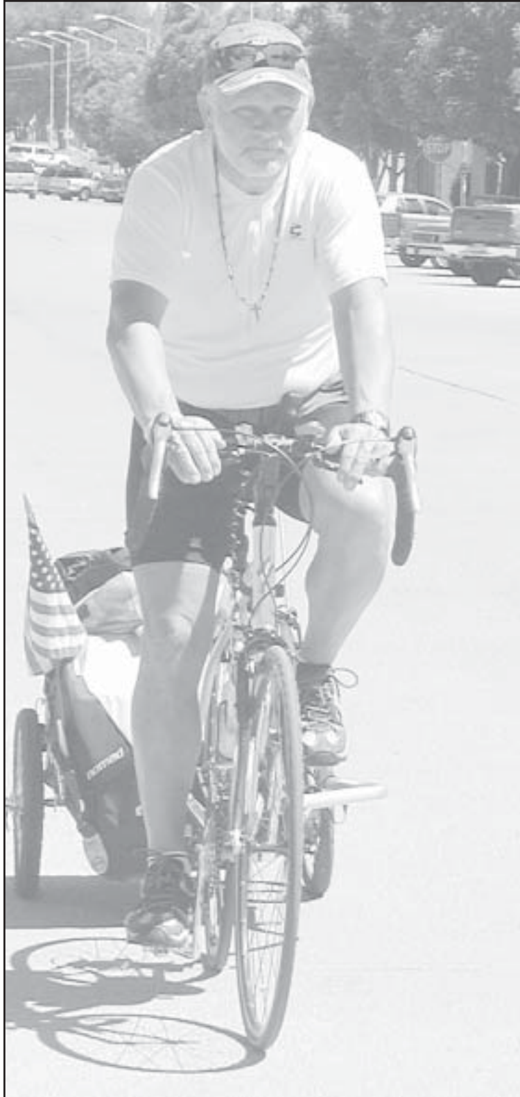
BIKER rides through St. Francis on his way back to Ohio.

He is on his way back to Ohio, an expected 4,000 mile round trip. He is returning with a greater faith in God and is looking forward to