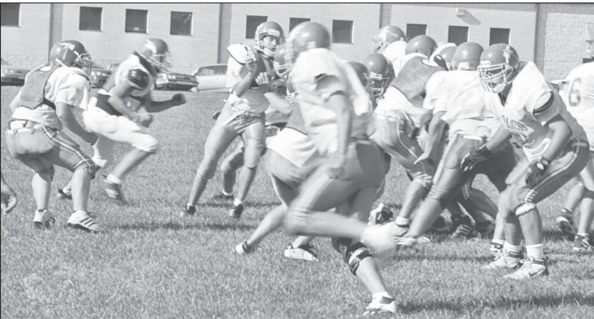
THE INDIANS have been on a busy practice schedule since Monday, Aug. 16. This Friday they will open the new campaign in Oberlin against the Red Devils in a Northwest Kansas League game.