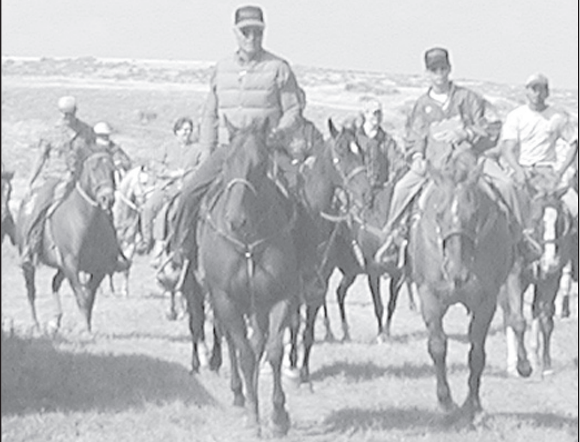
RIDERS WERE SADDLED UP and ready to go as they started out for a 2.5 hour ride north of St. Francis at the Faylor Red Angus Ranch on Sunday.

The St. Francis City Council allows two cleanups each year in an effort to make the city a more beautiful place to live.