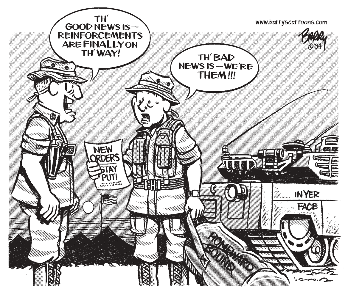
NEWS ITEM: TOURS OF DUTY IN IRAQ ARE BEING EXTENDED ...