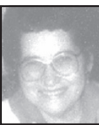
By Opal Collicott