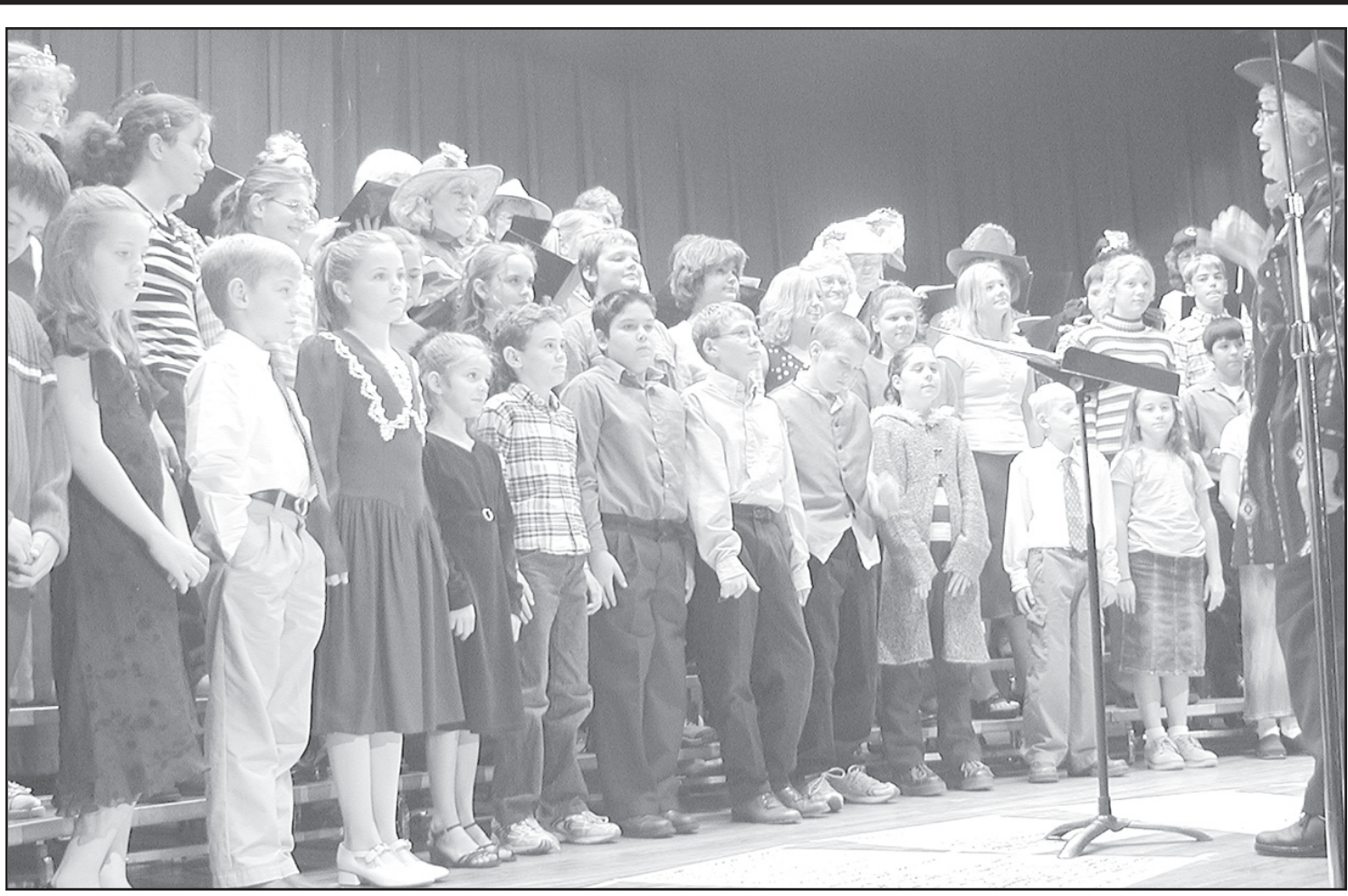
HONOR CHOIR sings during the Windsong performance held at the high school Sundy afternoon.