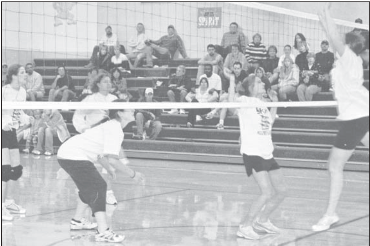
VOLLEYBALL—Several alumni players were in town to participate in a friendly games.