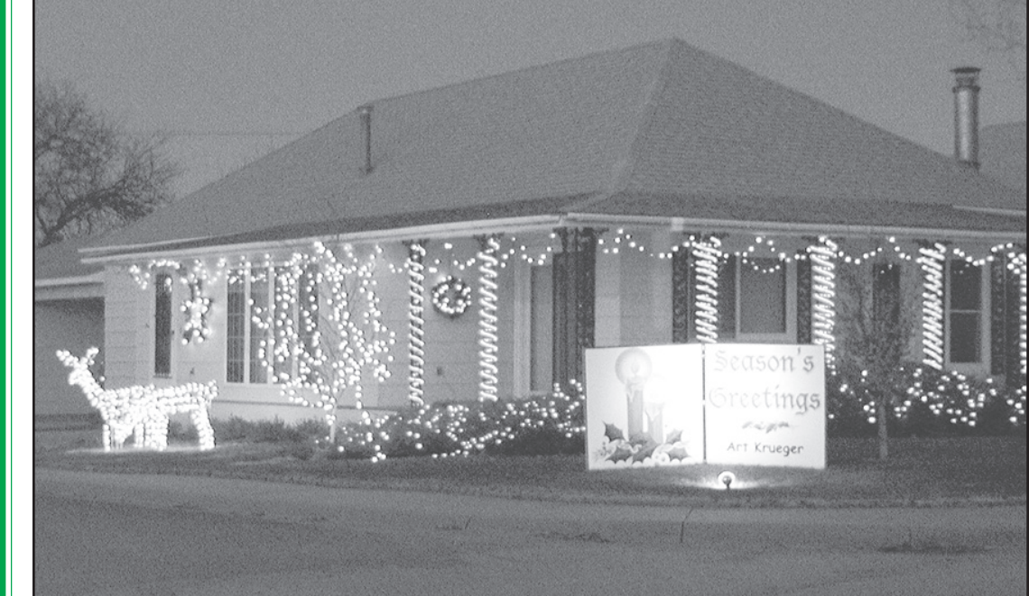
Art Krueger - 120 W. Spencer