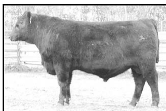
MILL BAR ALLIANCE 3810 Sire: Sitz Alliance 6595 Dam's Sire: GAR Sleep Easy 1009

LOT 25 205 DAY WT. 766 RATIO 100 ET EPD's: BW +4.8 WW +56 Milk +16 YW +99