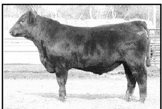
MILL BAR DATELINE 3860 Sire: Vermillion Dateline 7078 Dam's Sire: EXT

90 Power-Packed, Performance-Tested, Carcass Evaluated Bulls 300 Fancy, Bred, One Iron Angus Heifers 100+ Fancy, One-Iron Angus Replacement Heifers