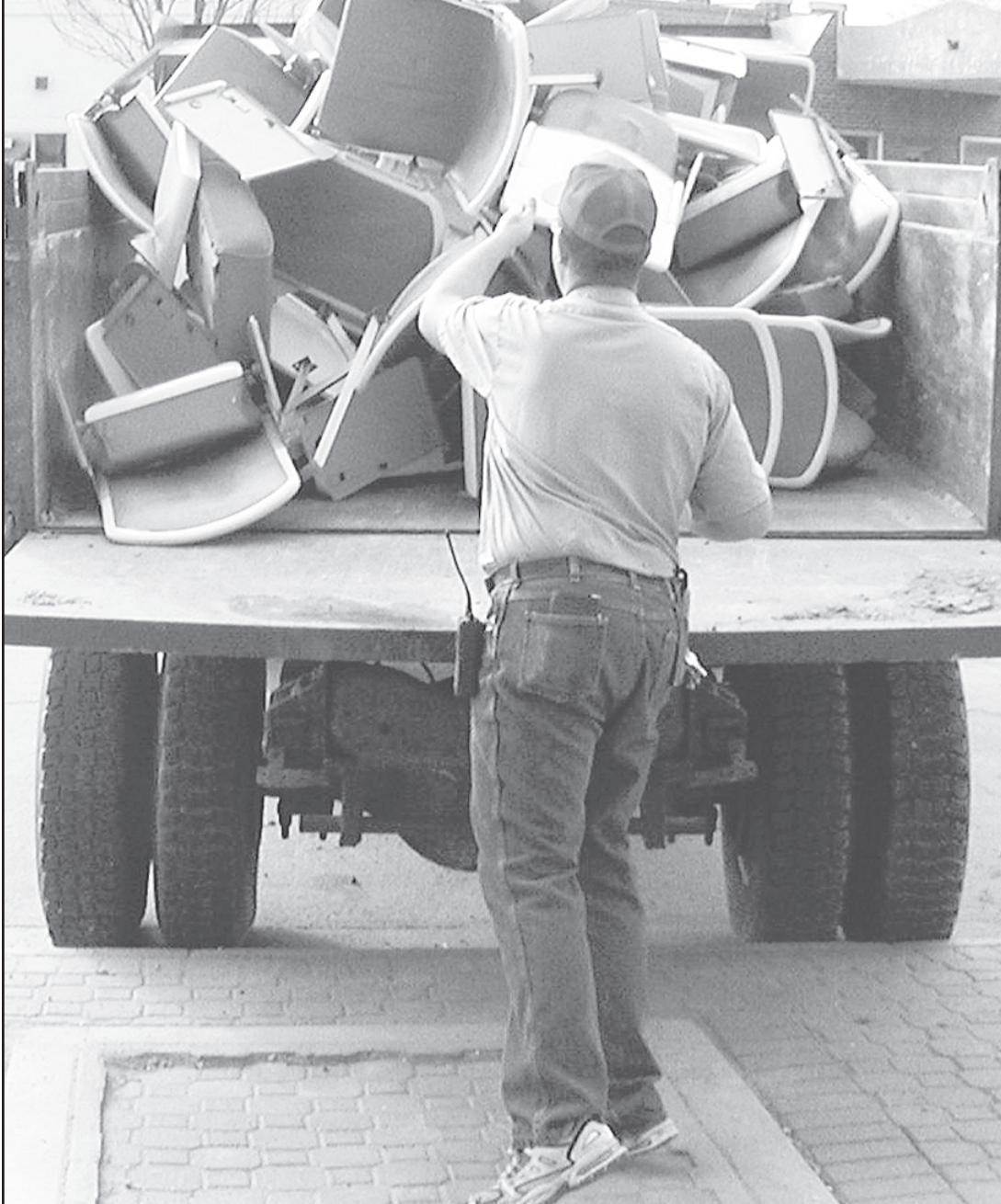
THE ST. FRANCIS CITY CREW has been busy during the last week removing the old theater seats. The theater will be closed this weekend and hopefully the new seats will be here and installed before next weekend.