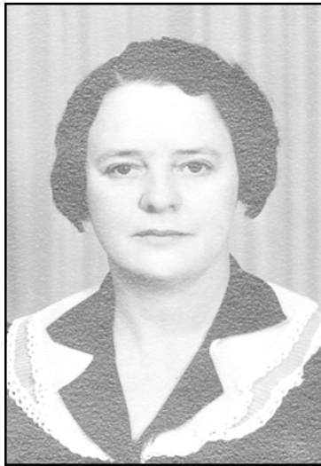
2005 Thresher Queen

The queen and her husband lived on the farm for nearly 40 years before moving to town.