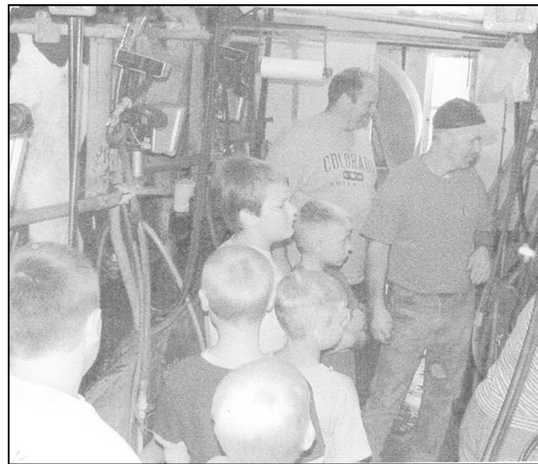
BOY SCOUT PACK 120 enjoyed a field day as they traveled to Atwood to observe a dairy farm.