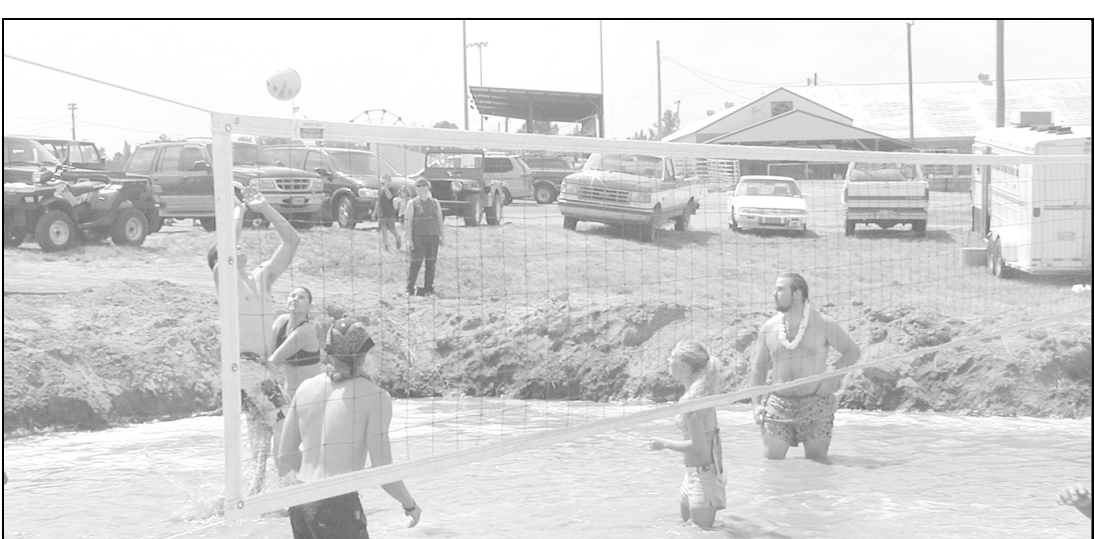
MUD VOLLEYBALL — Several teams signed-up to compete in the games held after the parade Saturday. Watch for results in the Fair Result special section.

An Oct. 29 wedding is planned at the First Lutheran Church to unite this Kansas State University Wildcat and this Oklahoma Sooner. Reception will follow at the Antlers Hilton in downtown Colorado Springs.