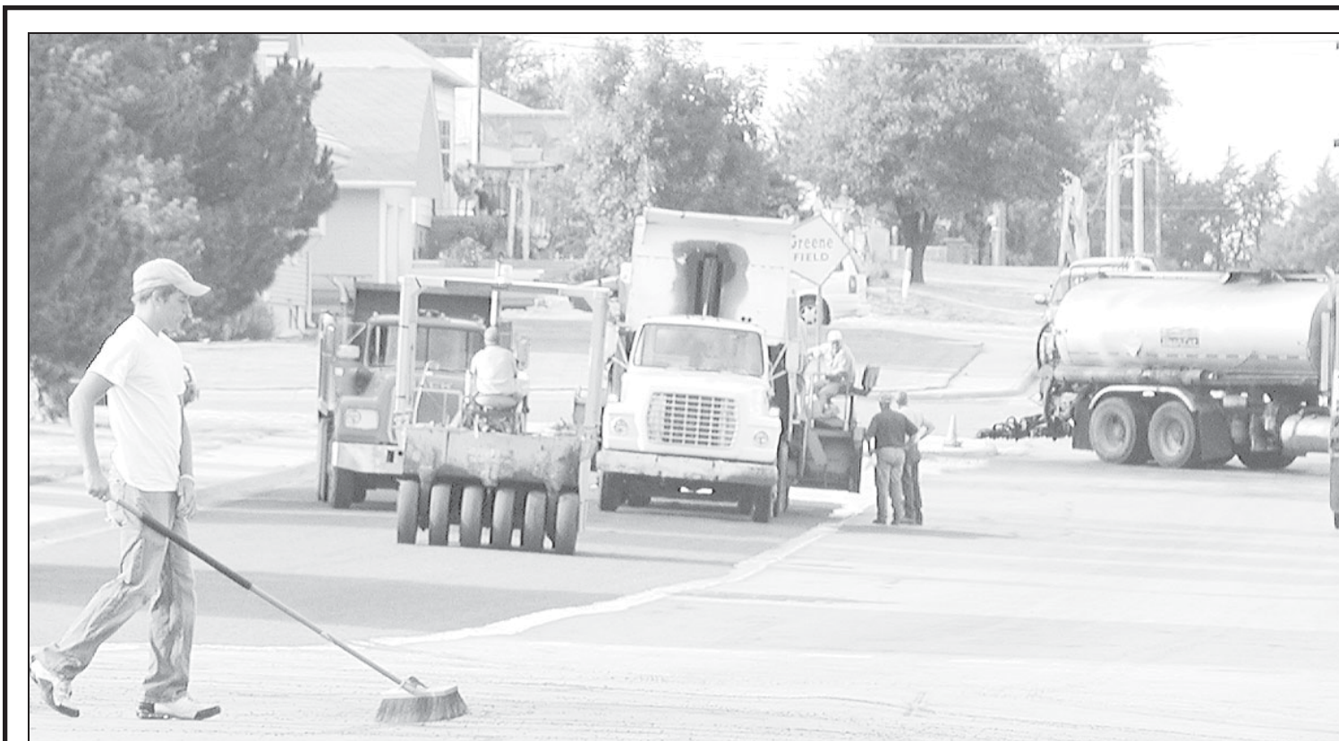
SEVERAL STREETS in St. Francis have been repaired the last week. The crew was busy sealing the street in front of the high school.