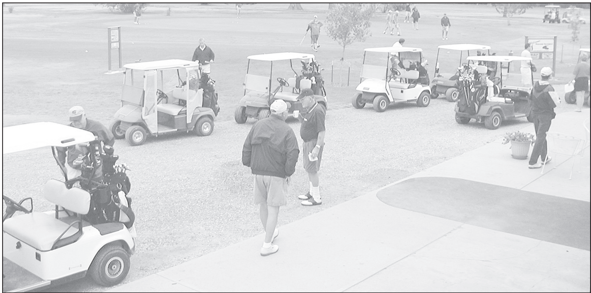
GOLFERS gather for the second day of the Riverside Rendezvous on Sunday morning. As the jackets indicate, the weather was a little cool for the early morning start time.