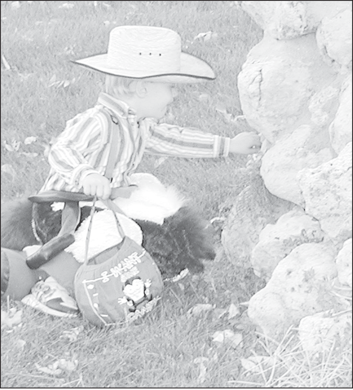
SHADRYON BLANKA was busy hunting for candy hidden in the park.