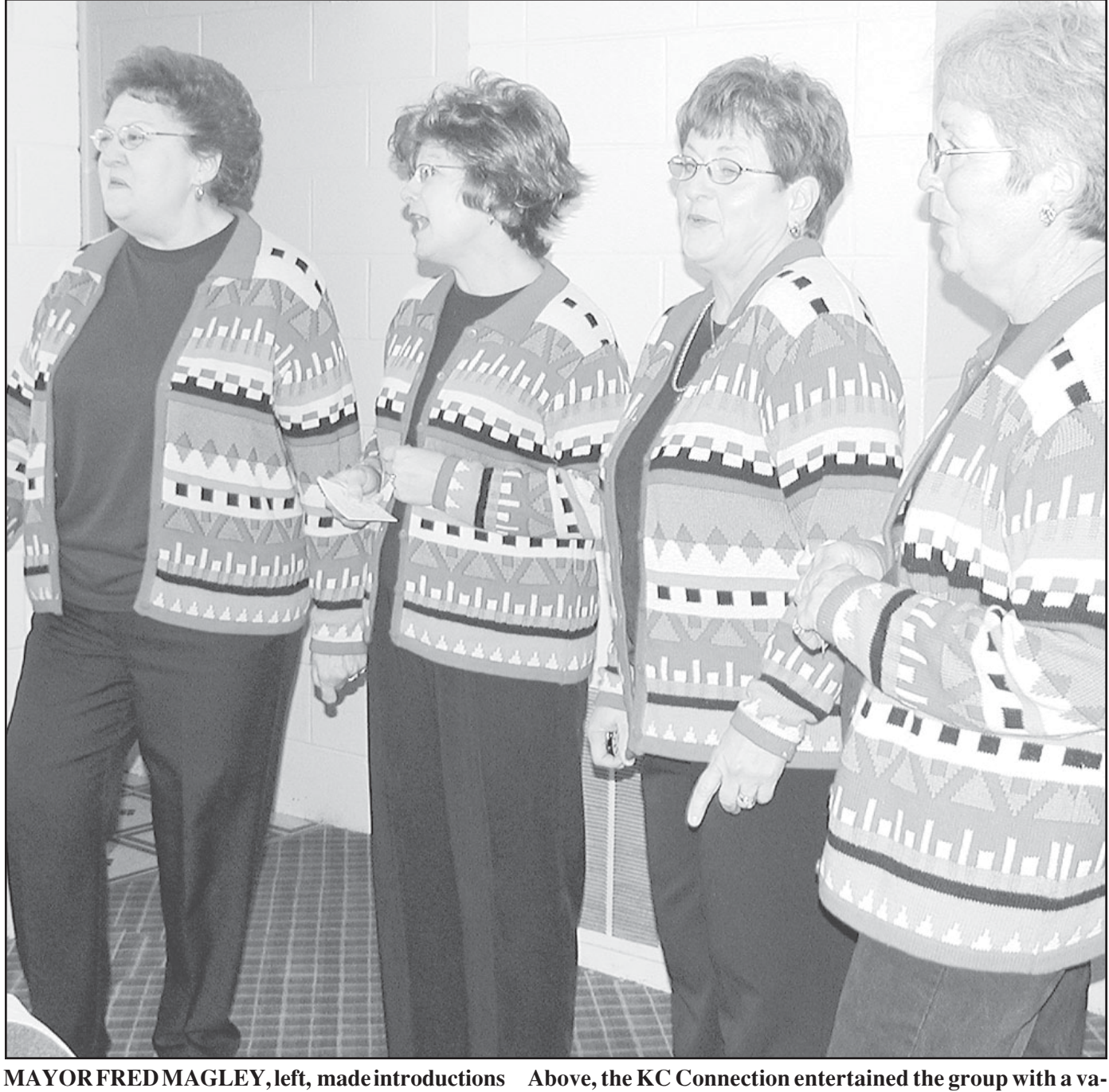
at the annual Wheeler Thanksgiving dinner held