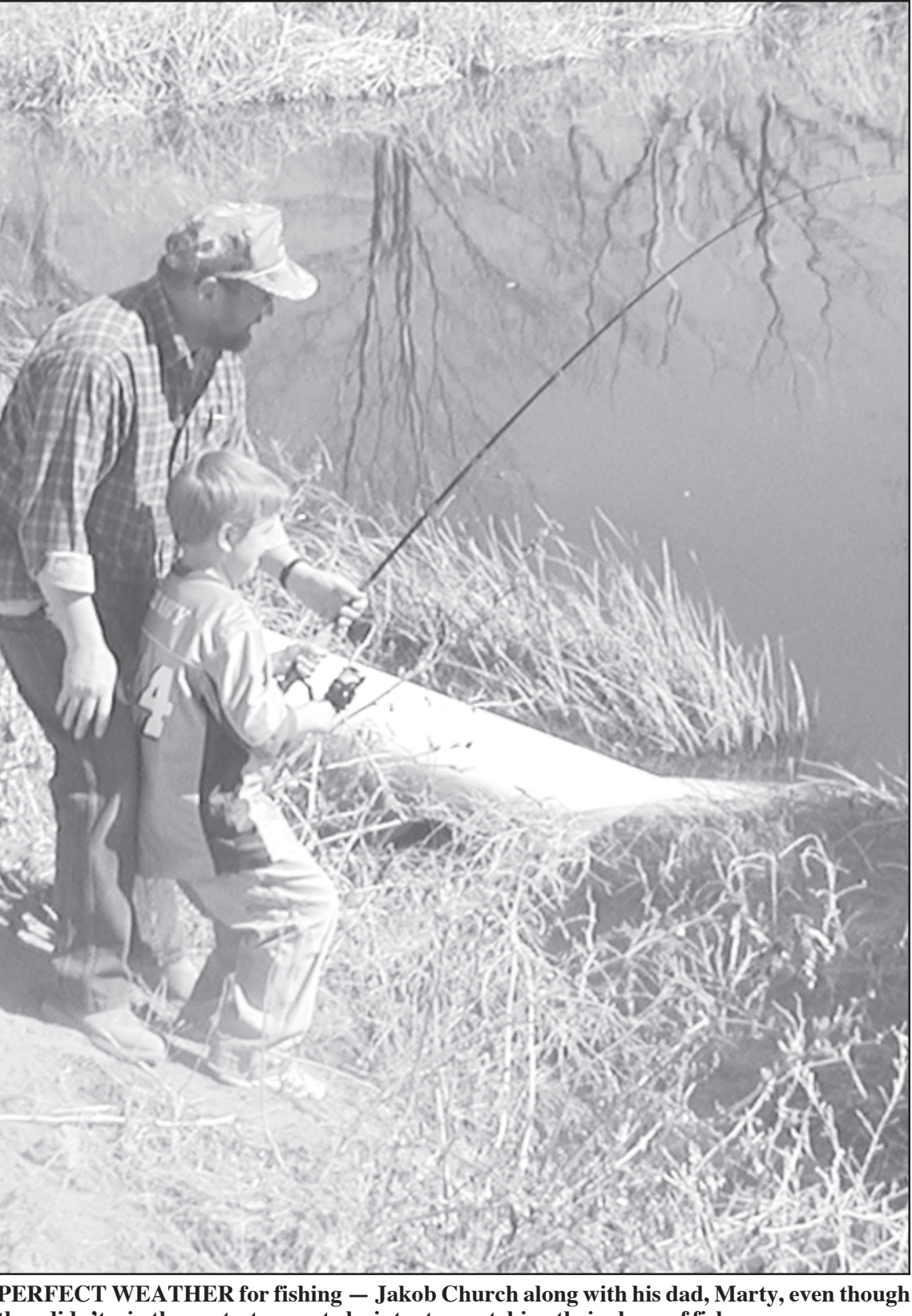
they didn't win the contest, seem to be intent on catching their share of fish.