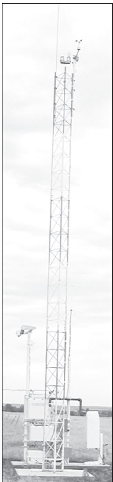
THE 30-FOOT TOWER and equipment has been erected at the south end of the airport runway.

The Airport Authority has been working for months on this project with the Kansas Department of Transportation Airport Improvement Project. The weather observation system was purchased with a 90-10 matching grant with the county paying only 10 percent. Just the system alone cost $76,000 plus there were other costs including See TOWER on Page 9A