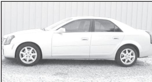
2003 Cadillac CTS Silver, V6, Leather, 41K mi., Very Sharp