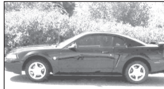
2004 Mustang Black, 28K mi., V6, Auto/AC/Tilt/Cruise/CD — Local trade