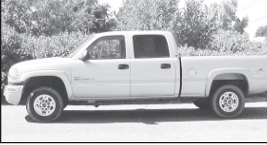
2005 GMC SLE Silver, Crew Cab, Diesel, New Tires and Wheels