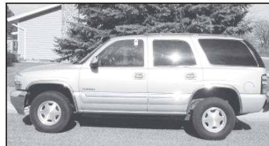
2004 GMC Yukon Pewter, 39K mi., 3rd row seat, SLE Package, Cloth