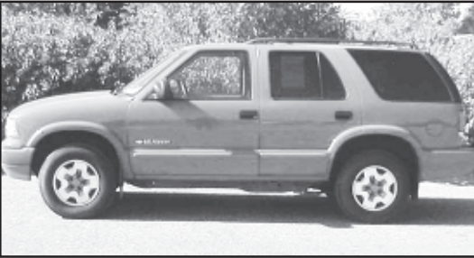
2004 Chevy Blazer LS V6, 4.3, 44K mi.,