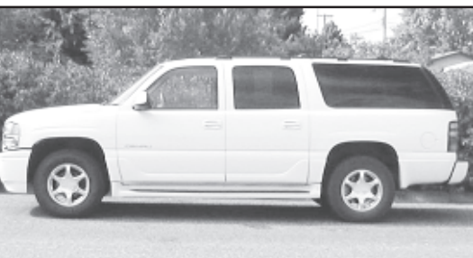
2005 GMC Yukon XL Denali White, 22K mi., Loaded, TV/DVD Player, Sunroof