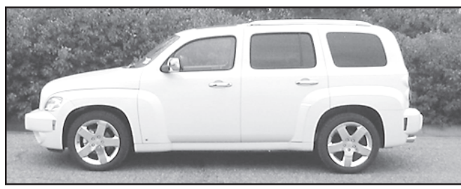
2007 Chevy HHR #476982