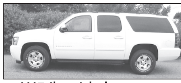
2007 Chevy Suburban #476979