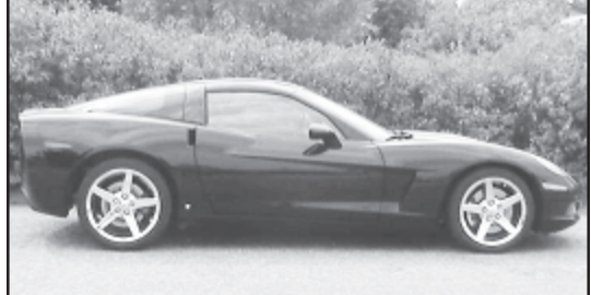
2007 Chevy Corvette #176977