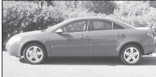
2007 Pontiac G6 #P76946