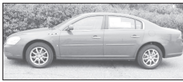
2007 Buick Lucerne #B76978

The Limited Powertrain warranty is now 5 years or 100,000 miles whichever comes first! Check out our great line of new and used vehicles