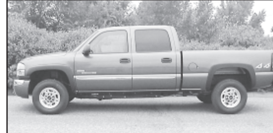
2007 GMC 3/4 Ton Crew Cab #G76975