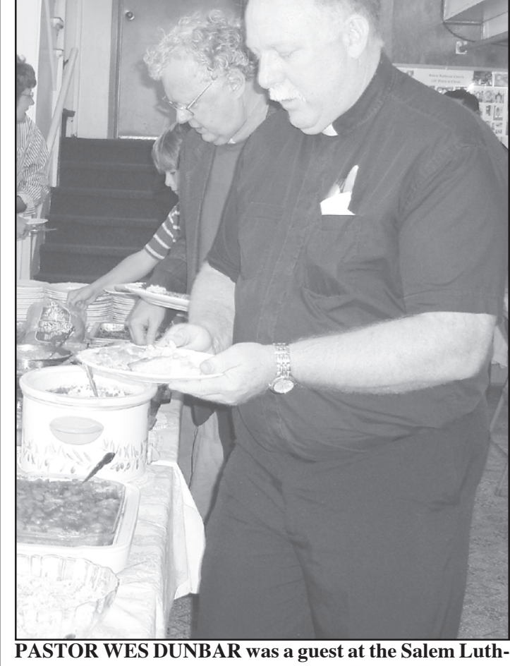
eran Church potluck on Oct. 8. Afterwards he gave a talk on the "New Congregations in the Evangelical Lutheran Church in America."