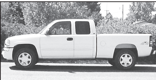
2005 GMC Ext. Cab, White, SLE, 4x4, Local Trade #G66774A