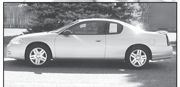
2006 Chevy Monte Carlo, Silver, Remote Start, CD Player, Cloth, 10K Miles #P6996