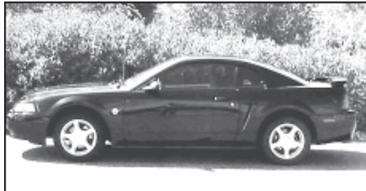
2004 Ford Mustang, Black, 6 Disc CD Player, Auto, Local Trade, Great School Car, 29K Miles #P6958A

1697 Rose Ave. • Burlington, CO 719-346-5326 • 1-800-546-5541 www.vincesamcenter.com