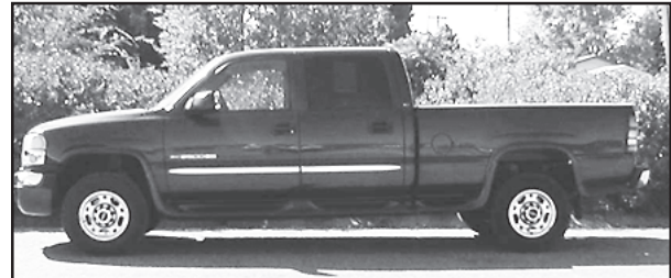
2004 GMC Crew Cab, SLT, 2 WD, Carbon Met, Leather Heated Seats, Very Clean Pickup, Local Trade, 40K Miles. #G76987A