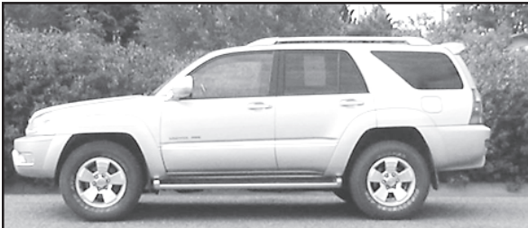
2003 Toyota 4 Runner Limited, Silver, Leather, Loaded, Sun Roof, Local Trade, Sharp, Ready for Snow #376868B