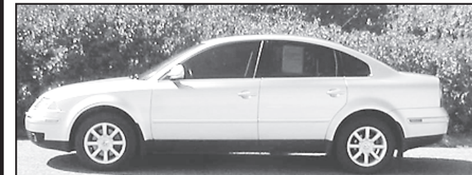
2004 VW Passat, Silver, 4 Cylinder, Leather, Sun Roof, Very Clean, Local Trade, 45K Miles #P6957A