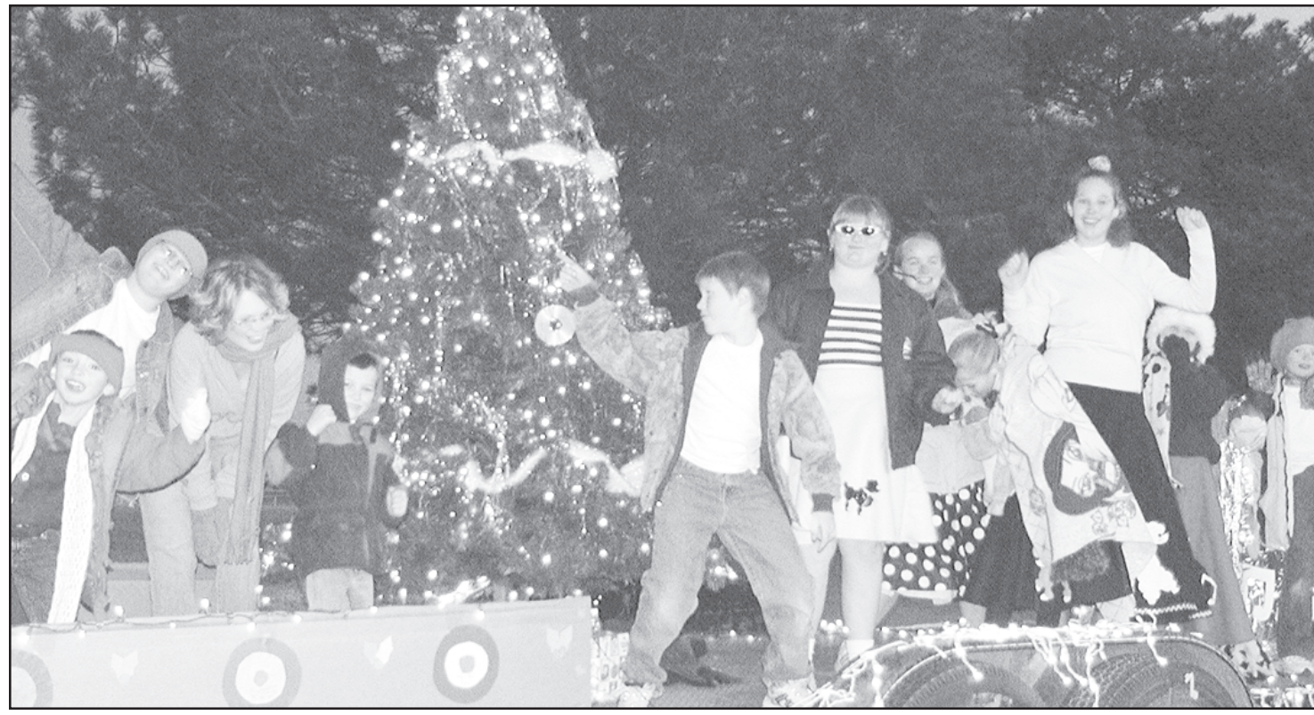
LAWN RIDGE FLOAT tied for first place in the Christmas parade held Nov. 24 at the Christmas opening in St. Francis. Hilltop General Store and the Good Samaritan Village floats were also first place.