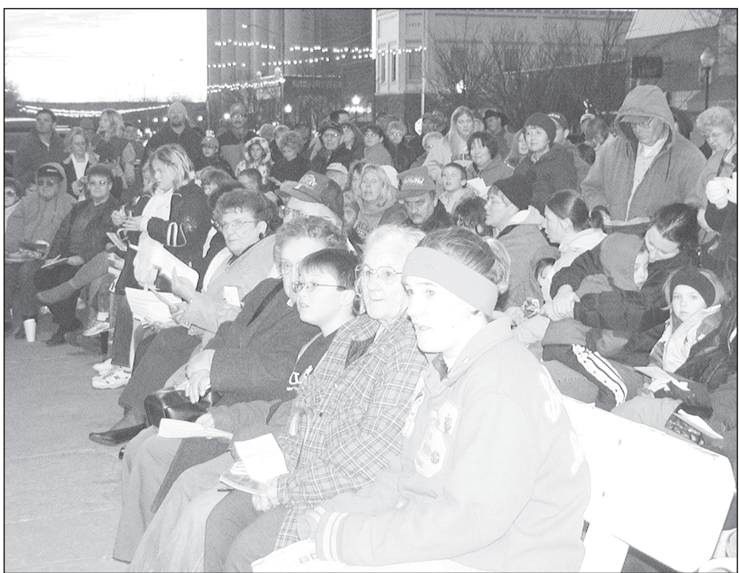
PEOPLE GATHERED on both sides of the street for the Christmas On Us and Chamber drawing held Monday night.