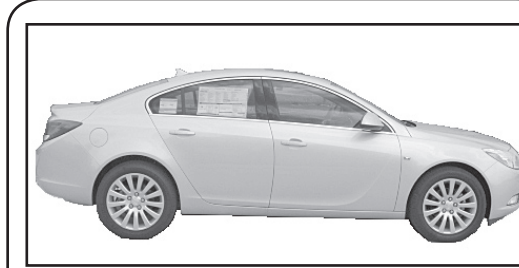
2011 Buick Regal, Leather, Sunroof

thought to ponder....Why do we wash behind our ears? Who really looks there?