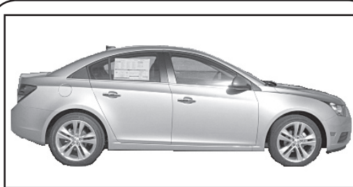
2011 Chevy Cruze, Ice Blue, Sunroof