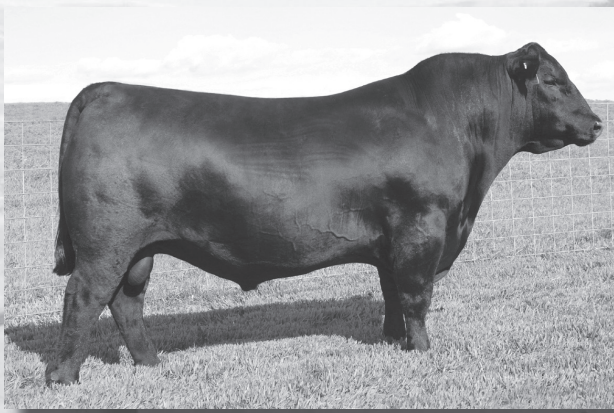
SAV Bismarck 5682

Imperial Auction Market - Imperial, NE - 12:30 MDT