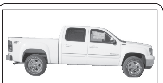
2010 GMC 1/2 ton Crew Cab, white, cloth, 4X4