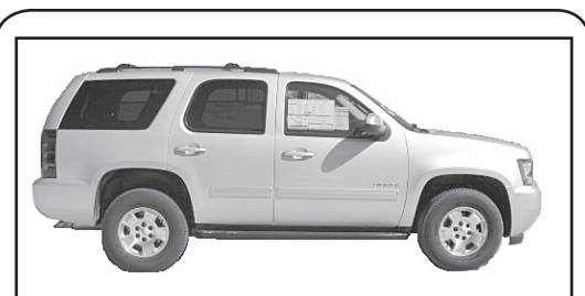
2010 Chevy Tahoe, Silver, cloth, DVD player

thought to ponder....If soap is used to make you clean, why does it leave a scum?