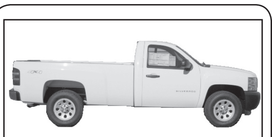
2010 Chevy 1/2 ton reg cab, white, w/tow pkg, 4x4

Do you feel that some car dealers treat you like it's St. Patrick's Day everyday? You know — trying to get all your green or hoping you left your green at home so they can pinch you. Not to worry at Vince's GM Center. We try to make it your day with 0% APR or up $5000 customer cash on select models.