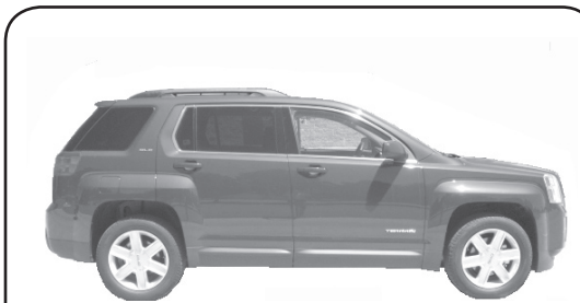
2011 GMC Terrain, Red, Cloth, FWD, 2220 Miles