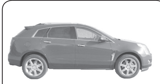
2011 Cadillac SRX, Crystal Red, AWD, Dual DVD Player

thought to ponder...What part of the monkey do you use a monkey wrench on?