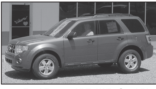
2012 Ford Escape XLT, AWD, Steel Blue Metallic, Sunroof and Tune pkg., $29,730, stock #T4630