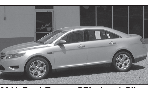
2011 Ford Taurus SEL, Ingot Silver, nicely equipped for $33,145, three to chose from, stock #85233