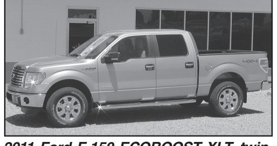
2011 Ford F-150 ECOBOOST XLT, twin turbo, 365 hp V-6, for under $40,000, stock # T5584