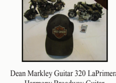
Harley Davidson Toys