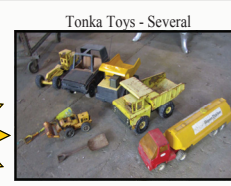
Tonka Toys - Several