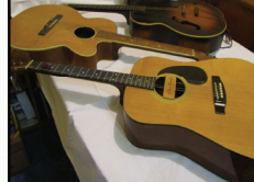
Dean Markley Guitar 320 LaPrima Harmony Broadway Guitar