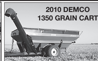
2010 DEMCO 1350 GRAIN CART