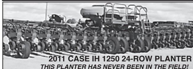
2011 CASE IH 1250 24-ROW PLANTER THIS PLANTER HAS NEVER BEEN IN THE FIELD!