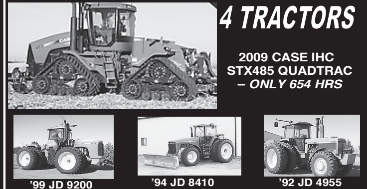
2009 CASE IHC STX485 QUADTRAC - ONLY 654 HRS