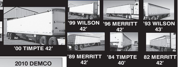
'99 WILSON 42'