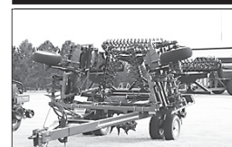
2009 21' SMART-TILL

TRUCKS, PICKUPS & 4-WHEELER: •'03 Int'l 9200 •'00 Int'l 9400 •'00 Int'l 9900 •'98 Int'l 9300 •'98 Int'l 9400 •'92 Int'l 9400 •'92 Int'l 9300 •'79 IHC Nurse truck •'77 Ford F-800 • IHC easy rider floater truck •'05 Toyota Tundra •'97 Dodge Ram 2500 •'93 Chevy 2500 •'83 GMC C-1500 •Honda 4-wheeler