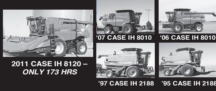
2011 CASE IH 8120 - ONLY 173 HRS