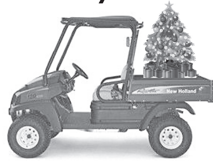
New Holland Rustler 125

She'll be anxious to use it to Fix Fence!! You can also use it to get the mail!