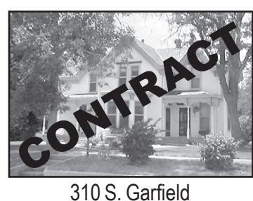
310 S. Garfield