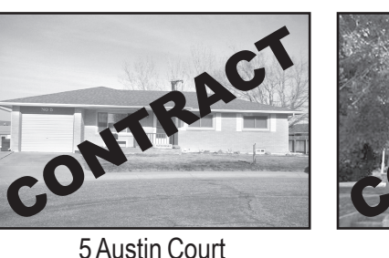
5 Austin Court