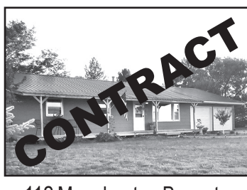
112 Manchester, Brewster