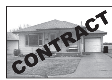
407 Center, Oakley