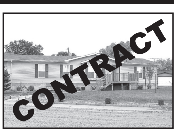
210 Iowa, Brewster