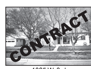
1025 W. 3rd