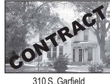
310 S. Garfield